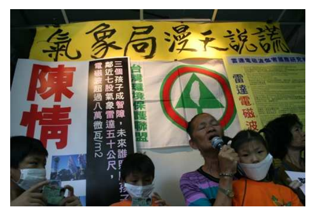
Fig. 9 The households within a range of 100 meters from the radar for six years, three children have become mentally retarded.