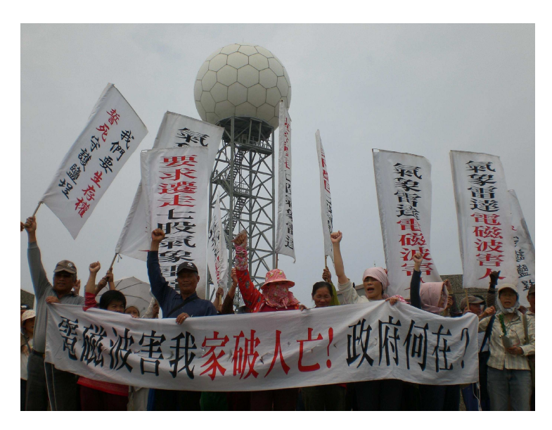
Fig.10 Chi Gu Yen-Cheng Village's Anti Doppler Weather Radar Electromagnetic Radiation Petition

Upon activation of the radar, the villages weren't aware of anything out of the ordinary, but after 2 or 3 years, those who lived or worked within close proximity of the radar suffered from diseases such as but not limited to sudden palpitations, cardiac arrests, heart diseases, liver cancer, pharynx and larynx cancer, intestines cancer, lymphatic cancer, uric acid tumors, brain tumors, bladder cancer, breast cancer and