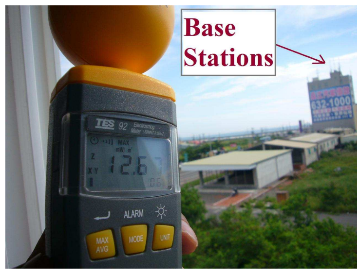
Fig.4 High electromagnetic radiation in the room of the cancer victim who suicide in 2007 at Chi-Lou community. The base stations had been asked to tear down in 2008.