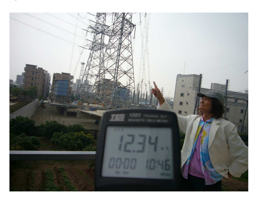
Fig.7 On Zhi-Chiang Street of Wo-Fong Jia-In Village, many high-voltage electricity towers are located close to the community district with many web-like cables carrying this electricity passing over rooftops.

Numerous thesis reports have indicated that prolonged exposures to an environment with over 4mG of electromagnetic radiation will double the risk of leukemia for younger children. Yet on Zhi-Chiang Street of Wo-Fong Jia-In Village, many high-voltage electricity towers are located close to the community district with many web-like cables carrying this electricity passing over rooftops. Even during hours of minimal electricity usage, testing equipment show high levels of electromagnetic radiation.