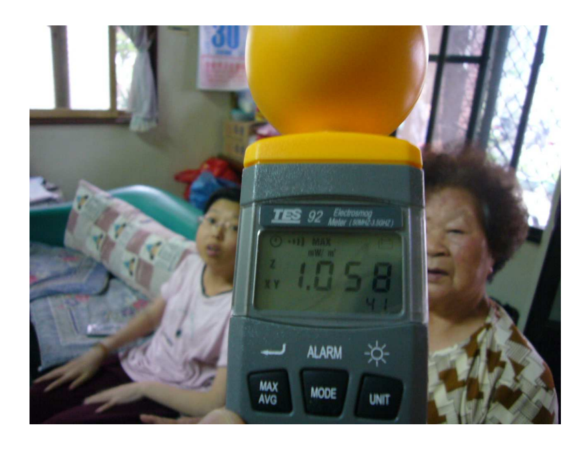
Fig. 3 Girl in picture got blood disease after the installation of the base stations in the Shin-Ann neighborhood of southern Tainan, over 6 persons (at least 5 were children) live within a range of 200 meters from the stations got blood disease.

times that of the normal background value. Even in the neighboring Nan-Shing Elementary school, radiation tests indicated a stunning amount of 6743 \mu W/m2. Not being able to endure these overwhelming levels of radiation, Mr. Huang, the Olympic bowling trainer, fell.